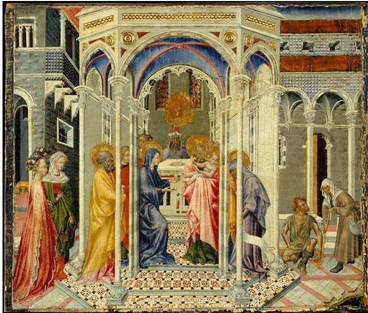
The Presentation of Christ in the Temple (1435) by Giovanni di Paolo →

God is love, so His plan is perfect, because He does everything out of love for us, to purify us. Our souls become perfected in this way. Because God is omniscient , knowing everything, He knows what we need to become holier. Looking at sacred art, we see harmony and balance that reflects how God’s plan brings everything together for our good.