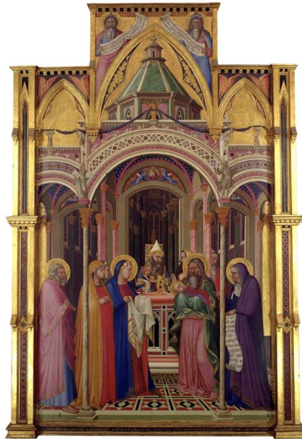
Presentation at the Temple (1342) by Ambrogio Lorenzetti