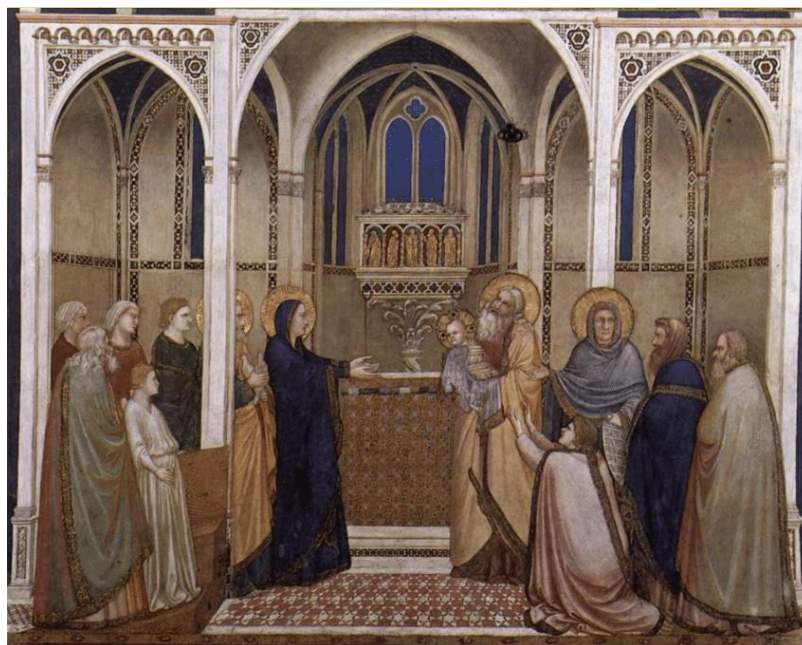
Presentation of Christ in the Temple (1311-1320) by Giotto

One of the Gifts of the Holy Spirit is piety. Piety is considered to be the order of the soul, when all is right in our soul, and there is peace. The liturgical year, our Church’s calendar of feast days and seasons, is ordered harmoniously, so that all of the seasons and feast days within them complement, or balance, each other. Just as there is rhythm in music, and in paintings, there is a rhythm to the Church year that helps us to grow in holiness and express our love for God year-round. The cycle of seasons repeats, never ending, but following the pattern of Christ’s dying and rising. At Advent, we remember Christ being born, and at Lent, we remember His dying, but in the sacraments, we always have new life in Christ. When we receive the Holy Eucharist, we receive Christ’s resurrected Body. Learning about Christ’s life throughout the year, we model our own lives after His, working towards Heaven, where our own souls can live forever.